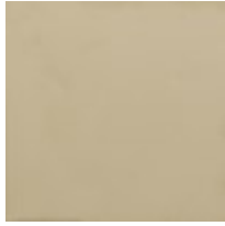
Whisper of Gold