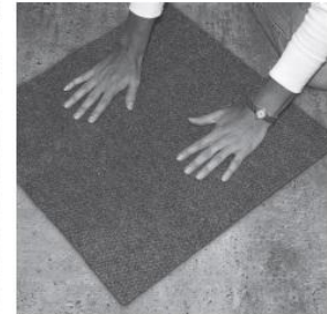
Press down firmly in desired location. This will lock the tile in that position. Continue to place tiles in desired pattern, rotating 1/4 turn. It's that easy!

USING ONE COLOR TILE: If you're using only one colored tile for the entire room, make sure the tile's arrow you place on top of the prior row is at a 1/4 turn. (Fig. E)