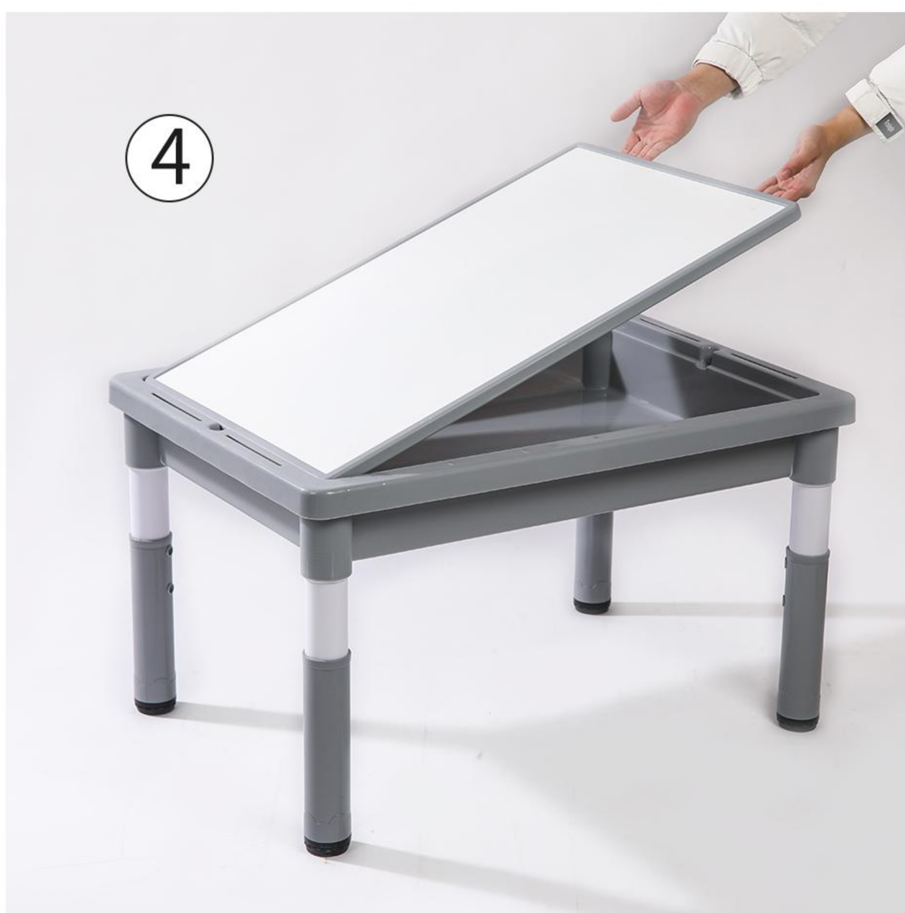
3 Install desktop.