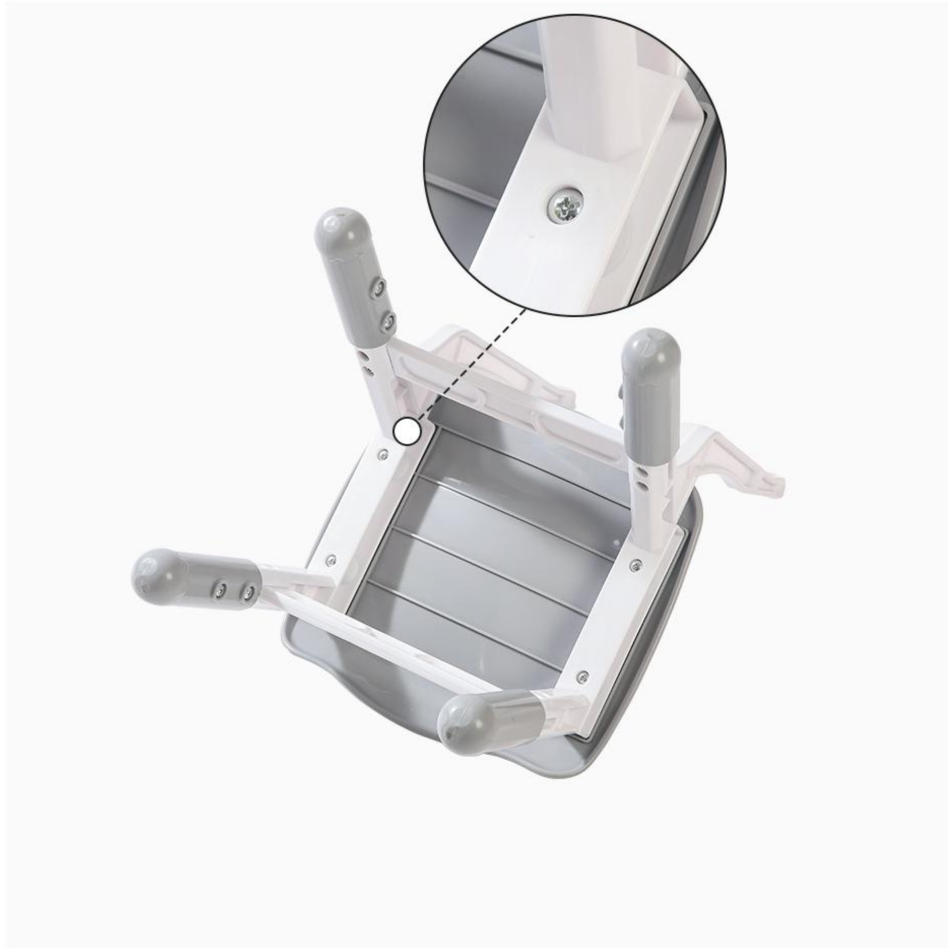
9 Secure the seat plate.