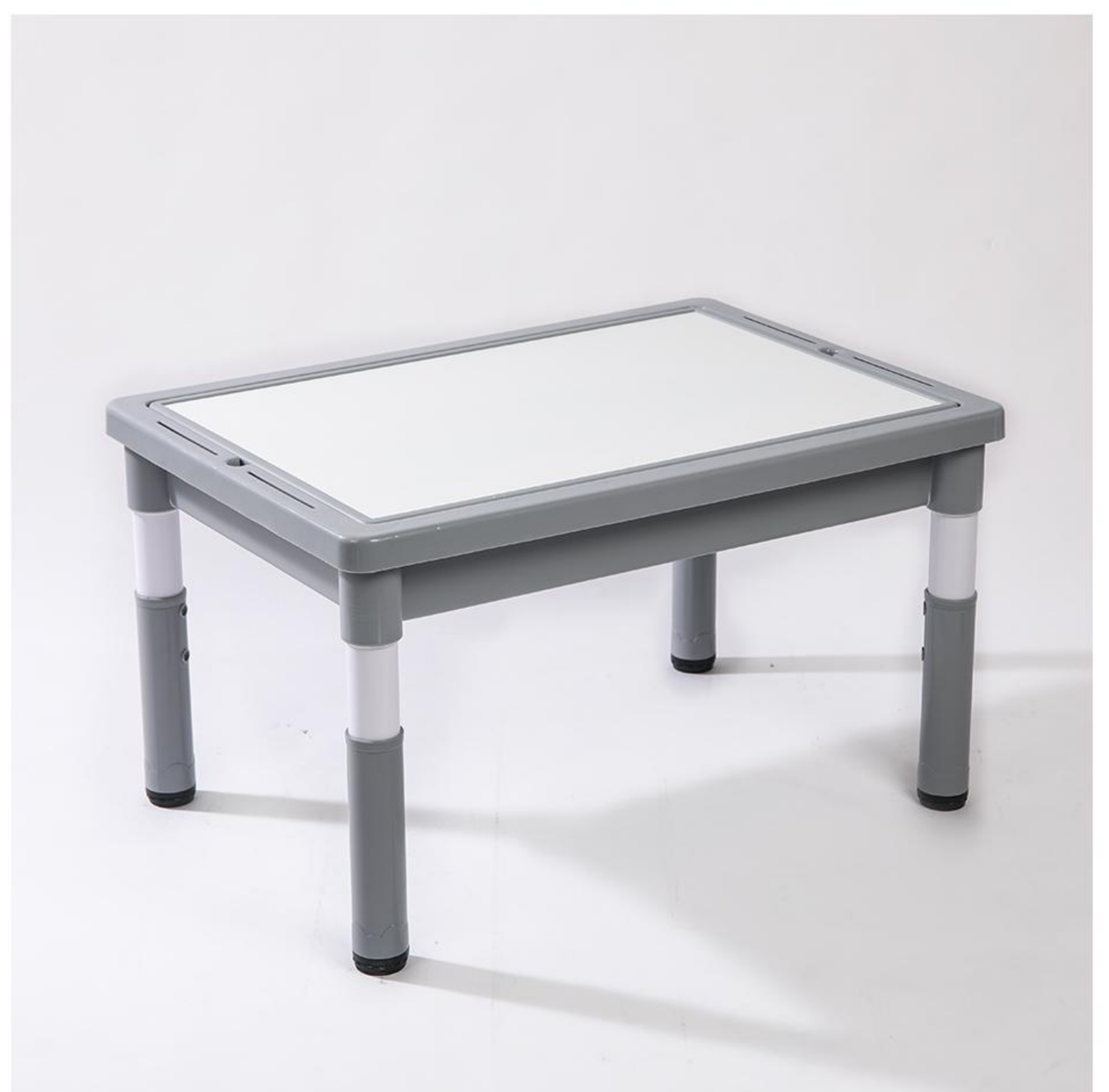
4 Complete table installation.