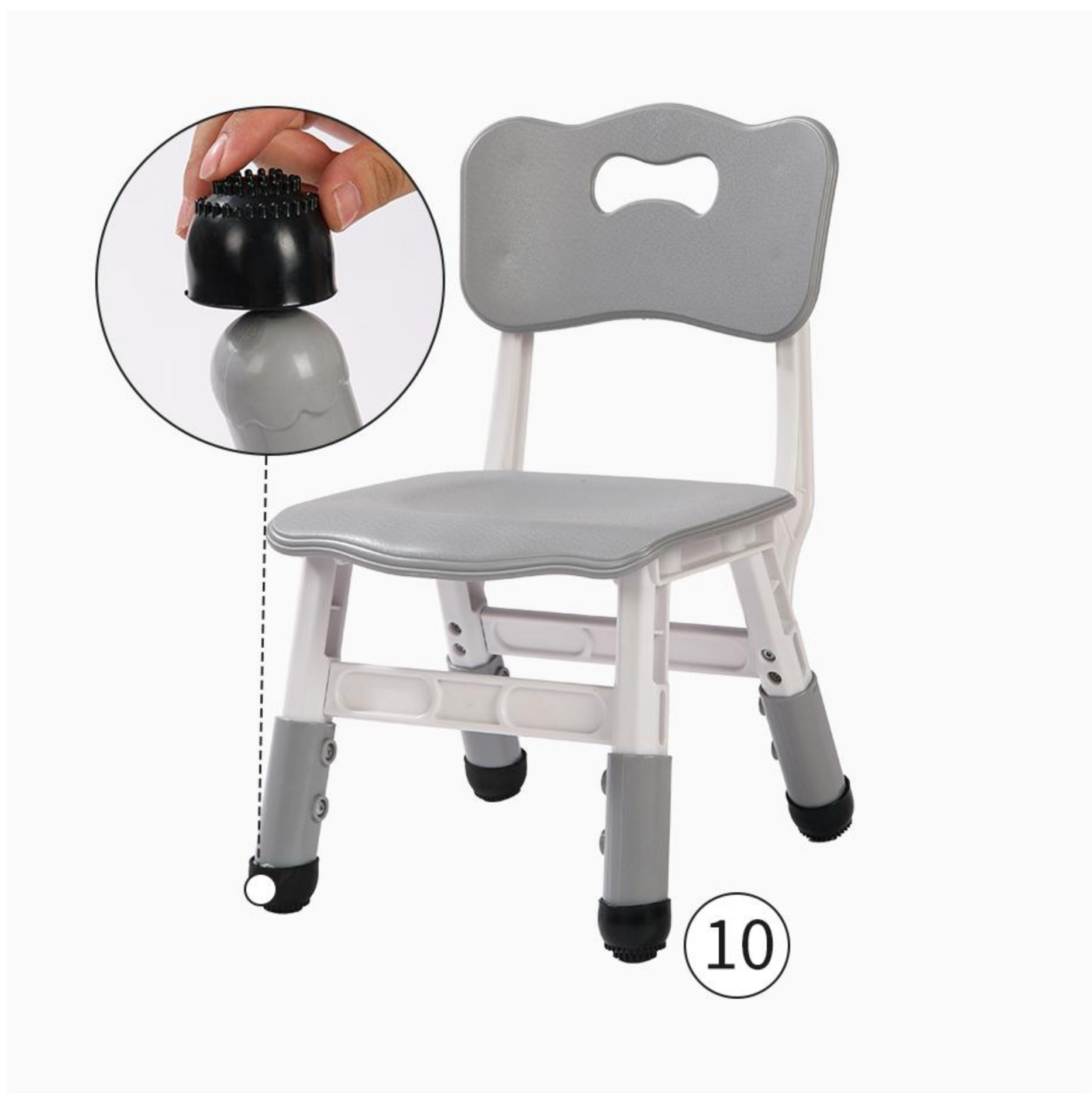
11 Install the anti-slip rubber sleeve.