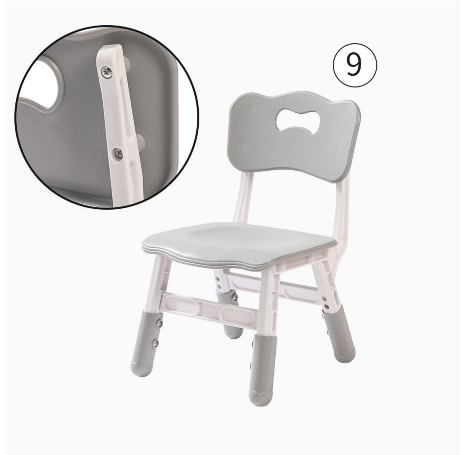
10 Mounting back.