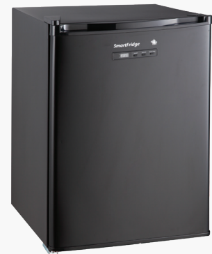
Solid Black Door