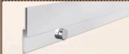
Dual Z-Bar Mounting System Even Weight Distribution • Commercial-Grade Stability