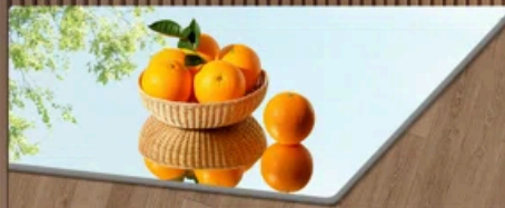
Polished Smooth Edges Sleek finish • Safe to the touch