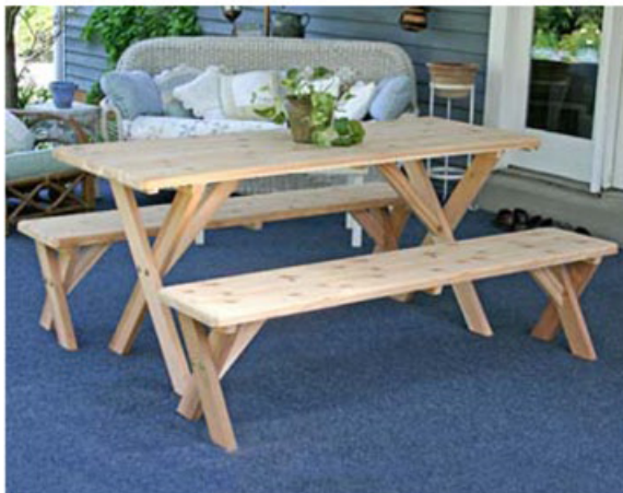
5 Foot Table Shown Above