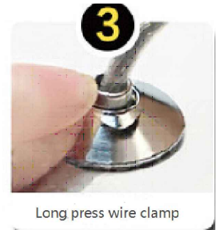
Long press wire clamp

Long press the wire clamp to adjust the length of the wire