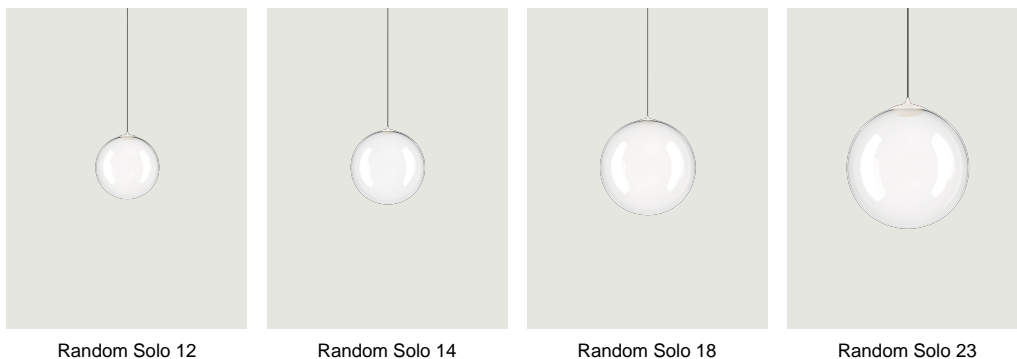
Random Solo 12