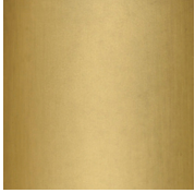
Brass - BRA