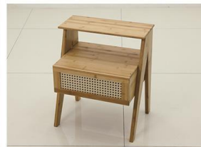
12. Finally, insert the drawer