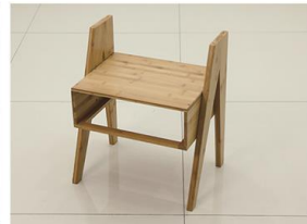
6. Install the large top layer board with long screws