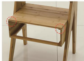
8. Insert the dowel into the side baffle