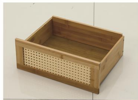
11. Install the drawer back cover with small screws