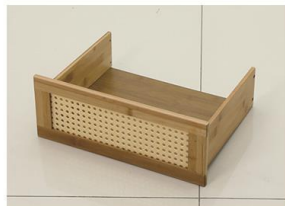
10. Insert the drawer bottom plate along the groove