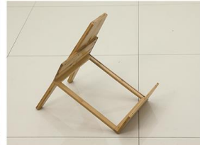
3. Install the left cabinet foot with a long screw