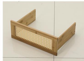
9. Install the front and side drawers with small screws