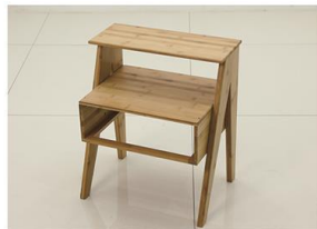
7. Install the small top layer board with long screws