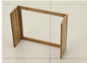
2. Install the right side baffle with long screws (pay attention to the alignment of the bracket and the groove of the layer board)