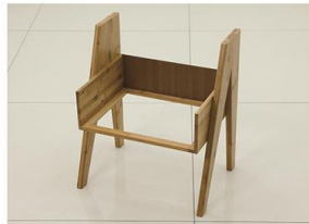
5. Insert the back panel along the groove