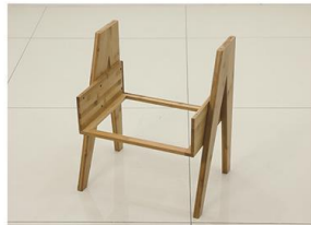
4. Install the right cabinet foot with a long screw