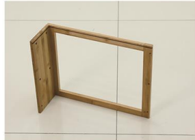
1. Install the bottom layer plate and the left side baffle with long screws (pay attention to the alignment of the layer plate grooves)