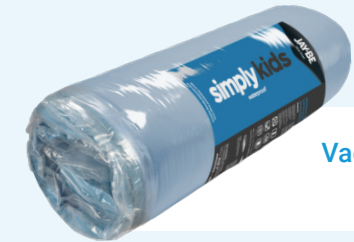
Vacuum Packed & Rolled