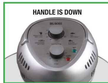
HANDLE IS DOWN