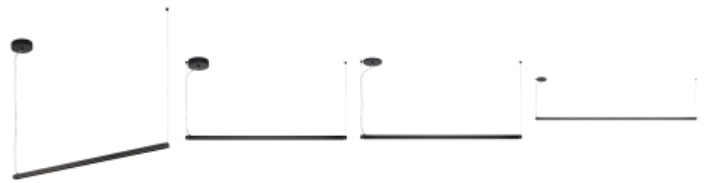
Anodized Black Surface Black 48 Remote Black 48 Remote Black 96

To view all available finish options, please visit techlighting.com