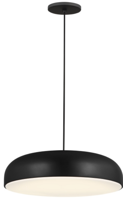
Nightshade Black Alt View

Includes 21.2 watts, 869 total delivered lumens, 3000K LED modules. Dimmable with most LED compatible ELV and TRIAC dimmers. Ships with 12 feet of field-cuttable black cloth cord. 120V-277V