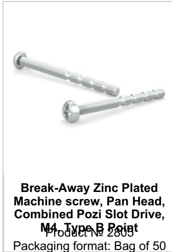
Break-Away Zinc Plated Machine screw, Pan Head, Combined Pozi Slot Drive, M4, Type B Point

Product № 2800 Packaging format: Bag of 100 units