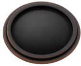
Oil Rubbed Bronze - RL020968