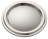
Polished Nickel - RL020296