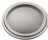
Satin Nickel - RL020265