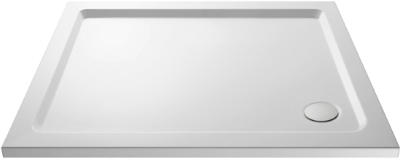
1100 x 900 RECTANGULAR TRAY

DESCRIPTION: Rectangular Tray 1100X900x40