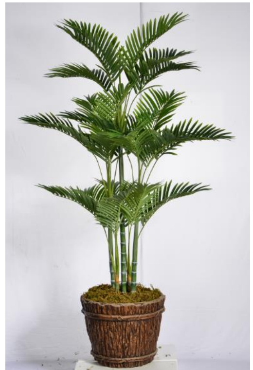
Finished 60"H Palm Tree