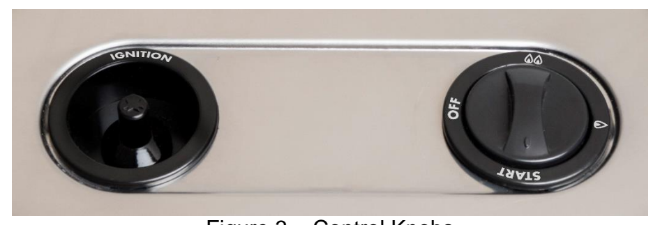
Figure 3 – Control Knobs