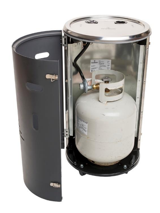
Figure 2 – Propane Cylinder