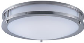
Linear LED Flush Mount