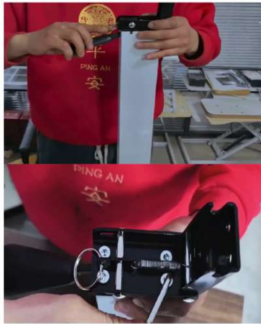
Step 1: Put the switch, handle and flip on the column and fix it with screw number 2