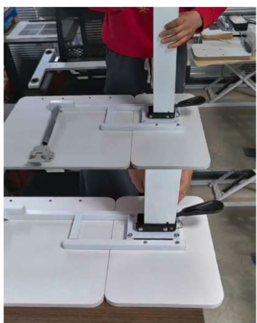
Step 3: Place the connecting piece on the base bracket and fix it with Screw number 3