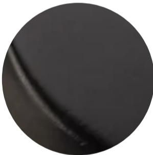
Oil Rubbed Bronze - 102