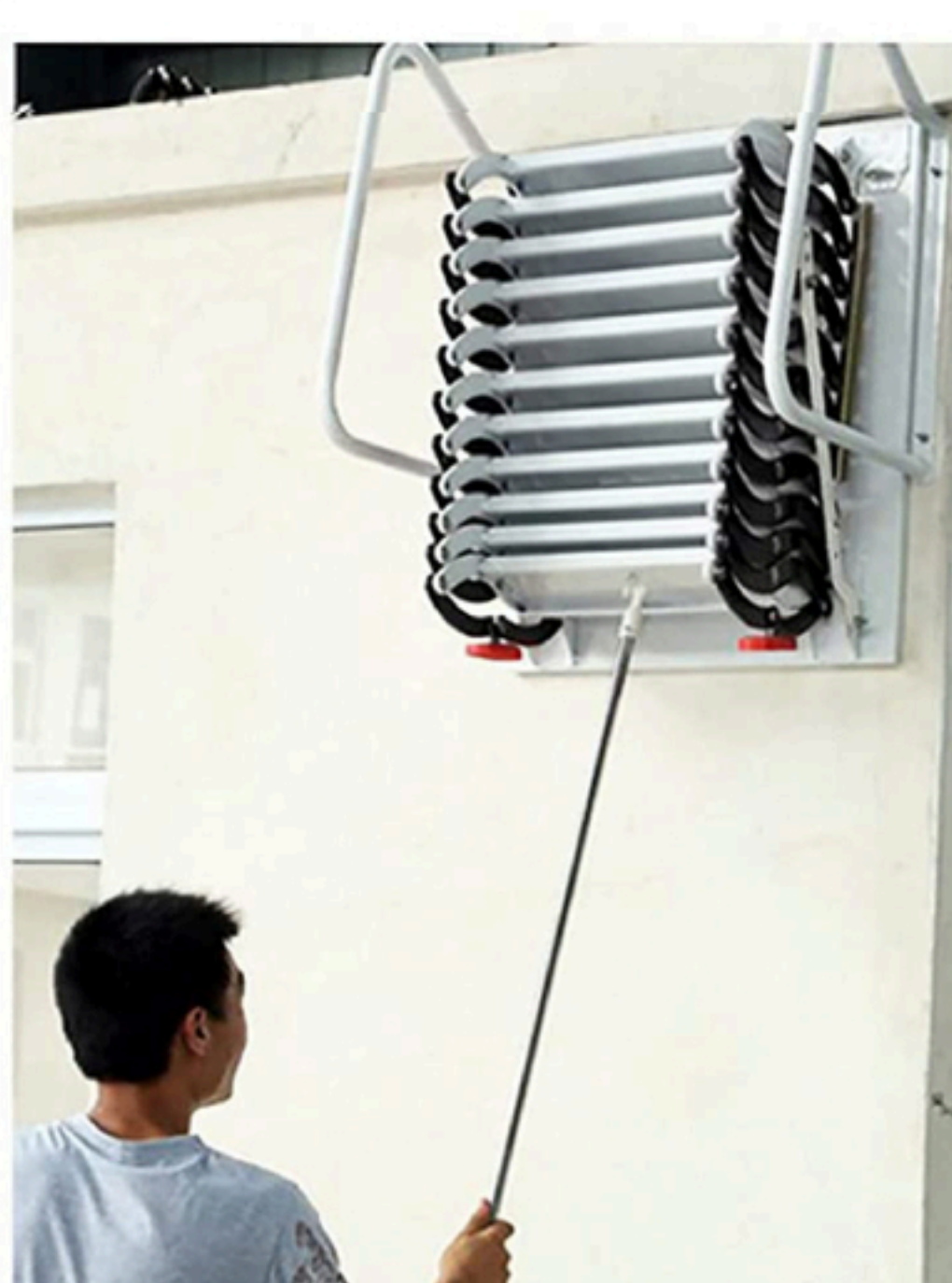
STEP.08 Space-saving and convenient to use