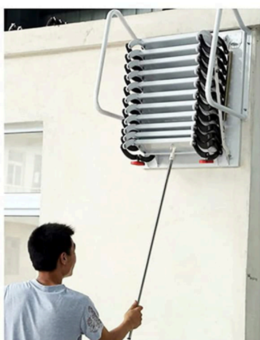
STEP.01 The rod hooks the buckle and pushes up