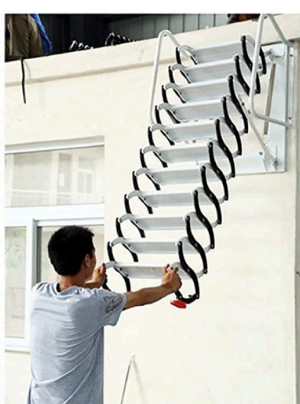
STEP.06 Push up