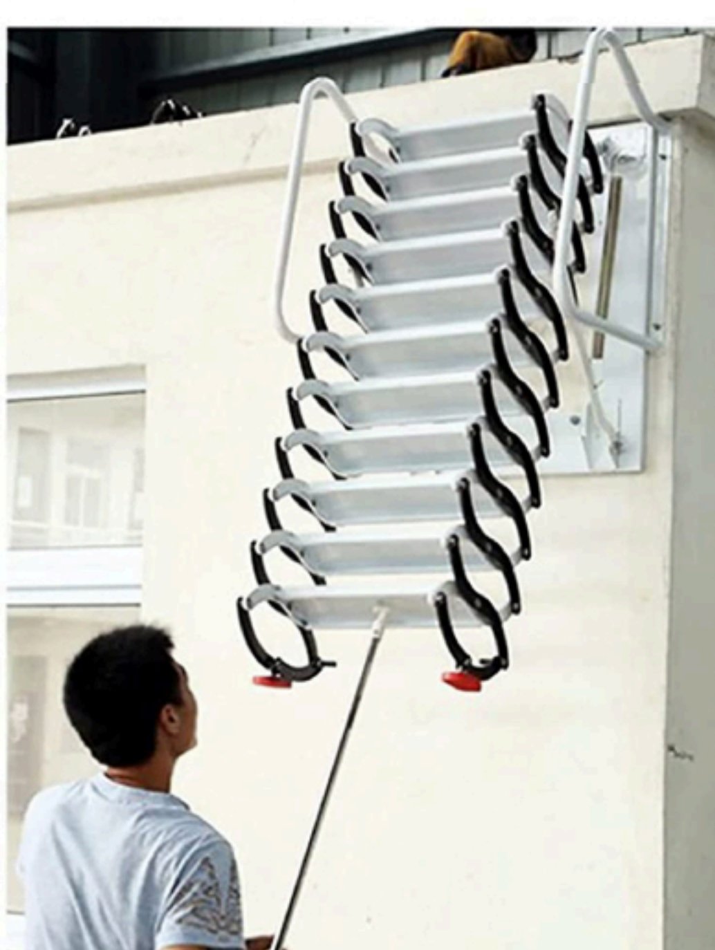
STEP.07 Push to the position and push up to the hook