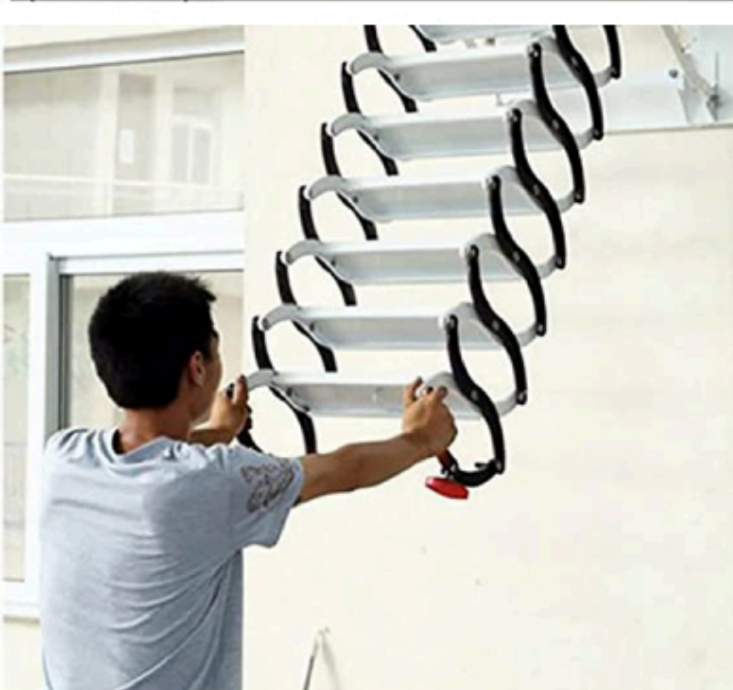
STEP.03 Step back and stretch down