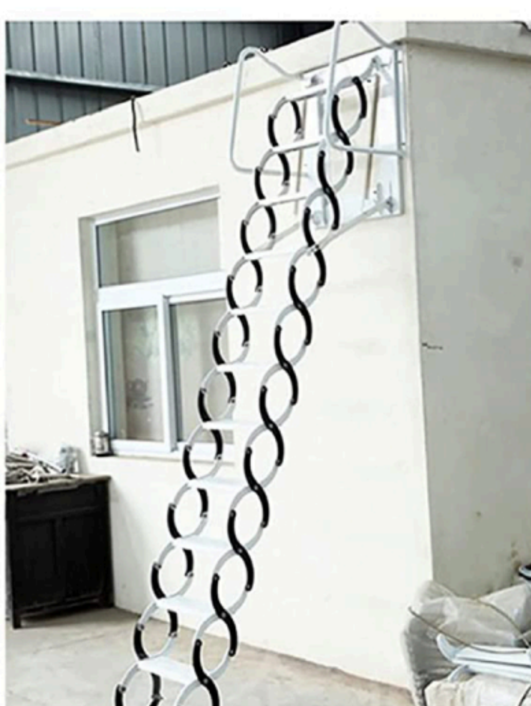
STEP.05 Easy to use