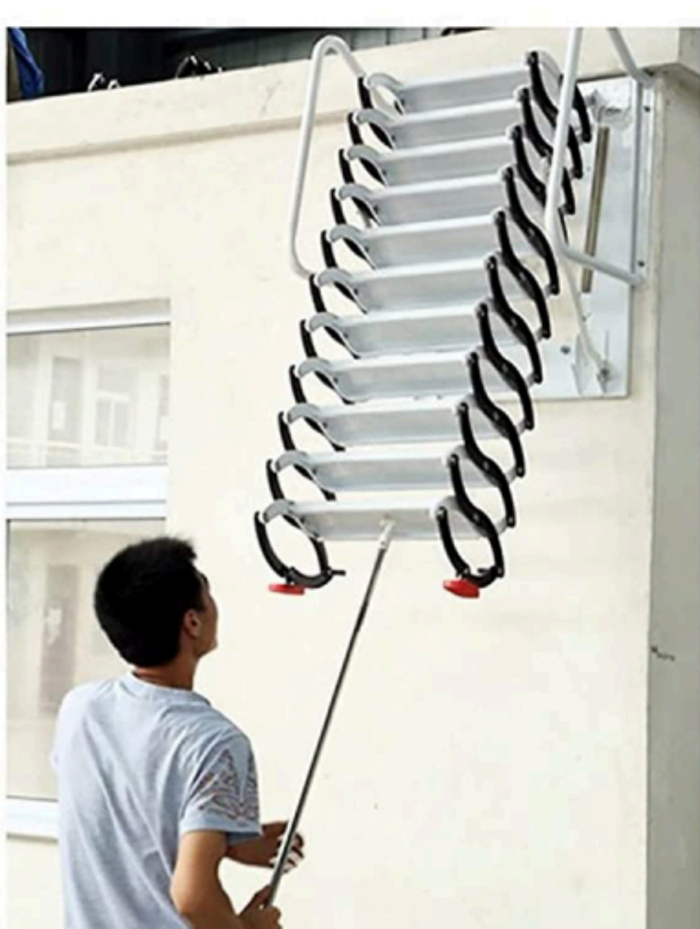
STEP.02 Pull down gently