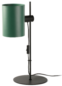
Table lamp with a cylindrical shape in green finish designed by Faro Lab . A unique design to give a modern touch to any space. Allows the light to be directed more firmly. Black structure.