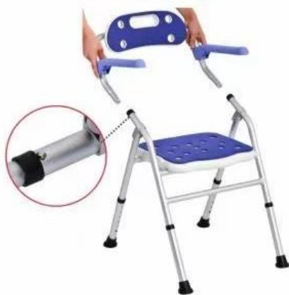
3. 将靠背扶手插入管内 锁定卡扣