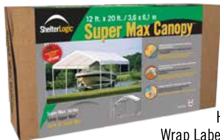
High-Impact Wrap Label Packaging

QUICK & EASY SET UP - With built in slip fit swedged tubing. Wide foot plates on every leg add stability/easy anchor points.