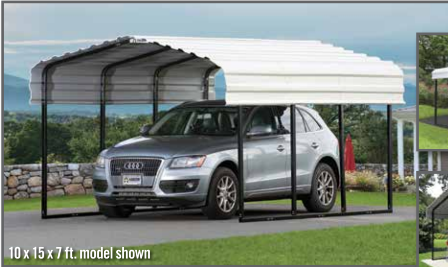
10 x 15 x 7 ft. model shown

Box 2: 61 lbs. / 28 kg 60.5 x 30.3 x 2 in. 153,7 x 77 x 5,1 cm