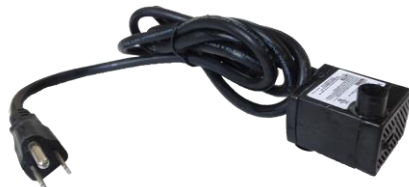
Fountain Pump 1x