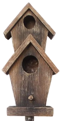
Fountain Top 1x