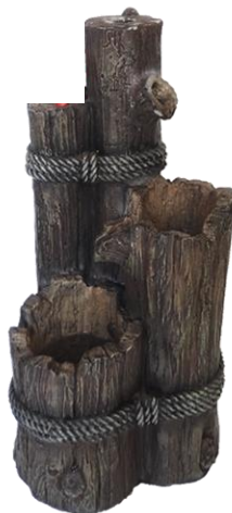
Fountain Base 1x