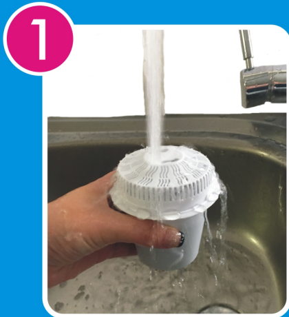
1. Rinse filter under a running tap gently shaking for 60 seconds.

Tip - Vitality Filter - on first use flush filter under running water to clear out loose carbon