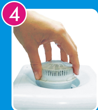
4. Fit the filter cartridge into the unit