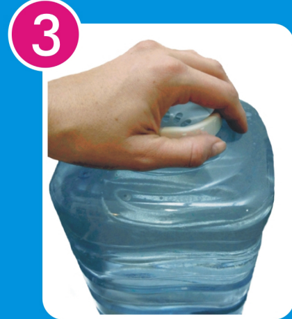
3. Close the bottle screw cap tightly