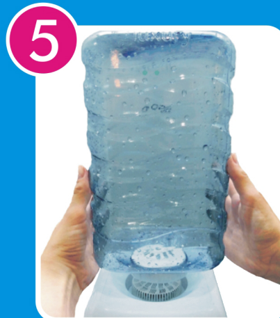
5. Turn bottle upside down into unit. Wait 1 hour before using your Little Luxury water cooler