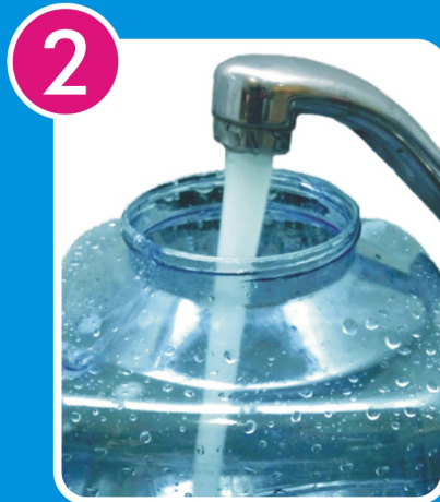
2. Fill bottle with cold tap water