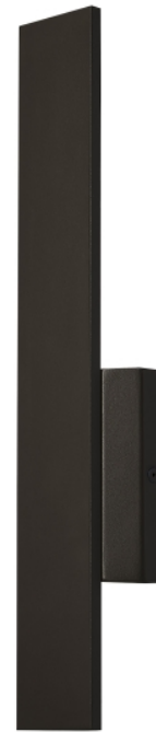
Bronze 3/4 View