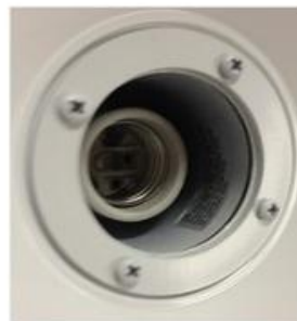
Exclusive Recessed Socket Design