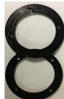
Shade Gasket & Washer