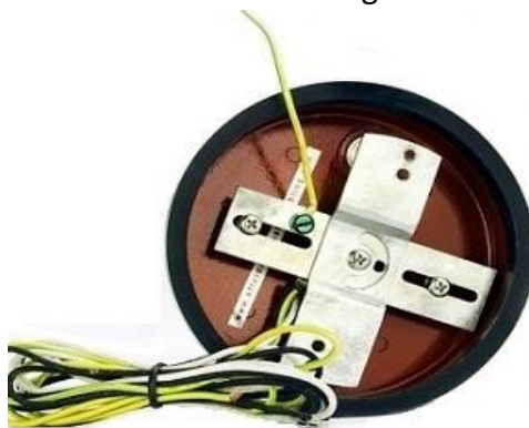
Heavy Duty Cross Mounting Yoke