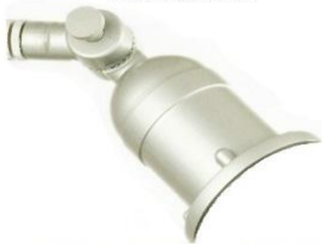
Exclusive Cast Swivel & Head Piece