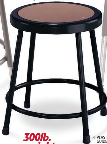
MODEL 6218 SHOWN