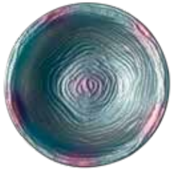
A. Splash Guard