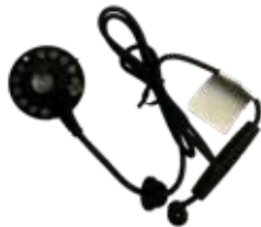
F. Fogger Unit