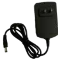
G. AC Power Adaptor