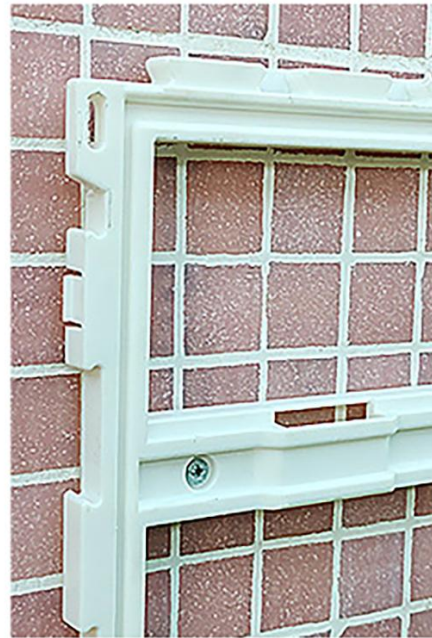
2. Fix the pendant with screws