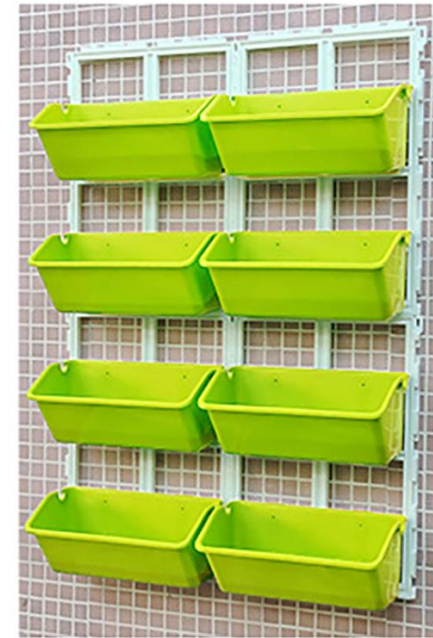
3. Hang the flowerpot up