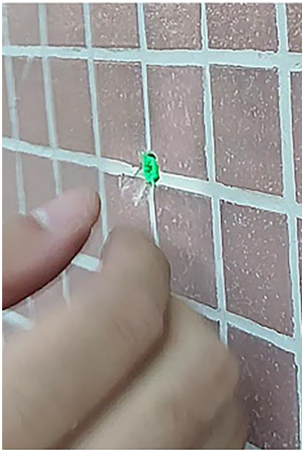
1. Drill holes and place expansion pipes