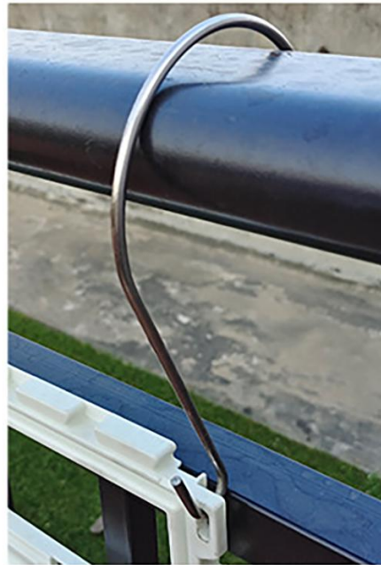
2. Hook the pendant onto the railing