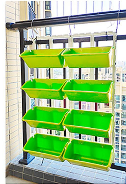
3. Hang the flowerpot up the railing