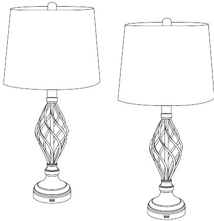
Table Lamp Set of 2