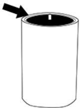
FT-450A (12 lbs) 11.25"W x 1.75"H

Step 5 - Insert the CPVC end of the tubing assembly into the coupling at the bottom of the water feature (FT-450A).