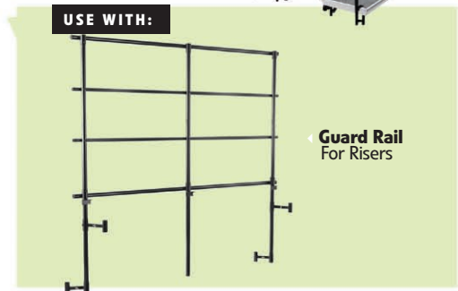
Guard Rail For Risers

NOW AVAILABLE: 4 th Level Add-On FOR THE Trans-Port Riser MODEL #TPA