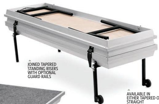
JOINED TAPERED STANDING RISERS WITH OPTIONAL GUARD RAILS

Straight and Tapered units cannot be combined. Straight units can only be ganged with straight units; Tapered units can only be ganged with tapered units.