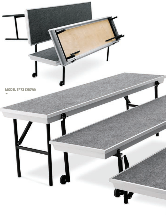
MODEL TP72 SHOWN