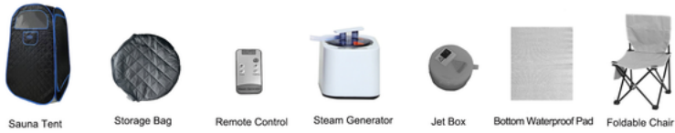
Sauna Tent Storage Bag Remote Control Steam Generator Jet Box Bottom Waterproof Pad Foldable Chair