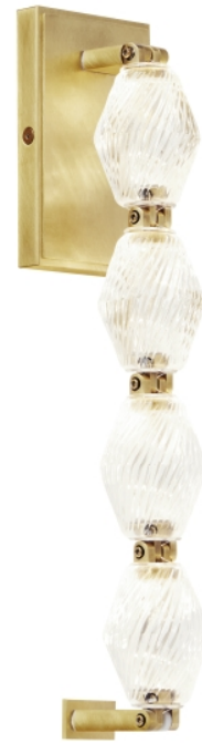
Natural Brass Alt