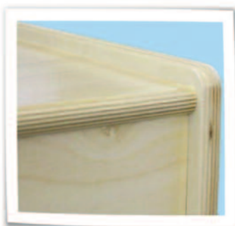
Typical Recessed Plywood Backs