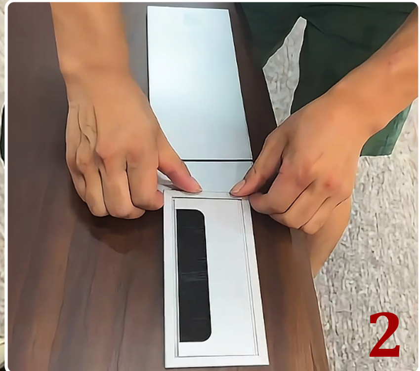
Then put the cable box into the reserved slot