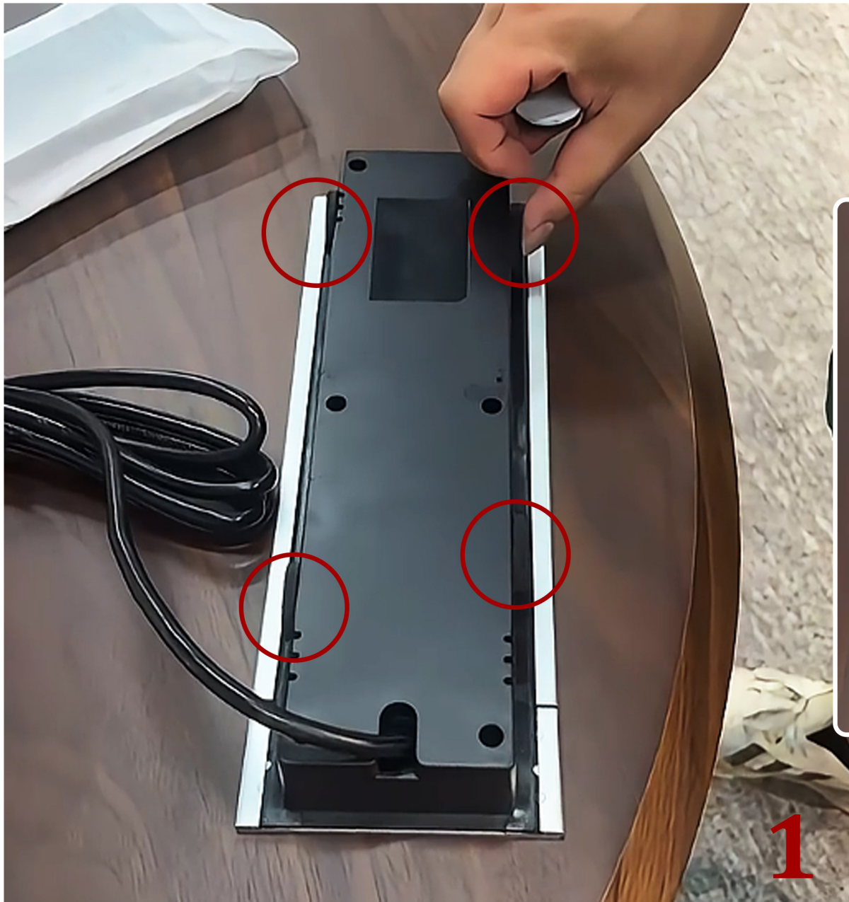
Attach double-sided stickers around the cable box