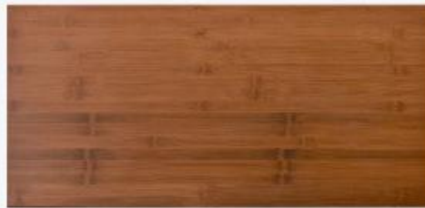
Top laminate*1 (grooved on one side)