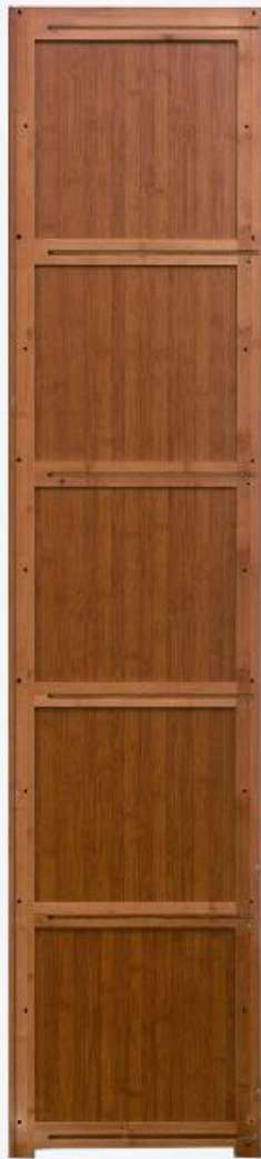
Side bracket right *1