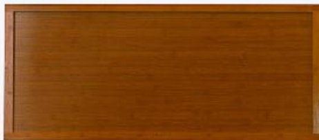
Door inner laminate*5 (smaller than door suction laminate)