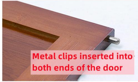
Metal clips inserted into both ends of the door