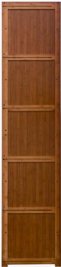
Side bracket left*1