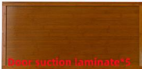
Door suction laminate*5 (double-sided with grooves)