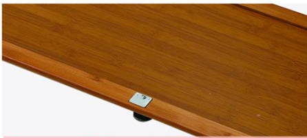
Door pull ring, door gasket installed with medium size screws