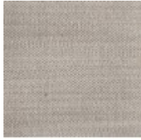
Body Fabric: 2785-35CC