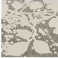
Pillow Fabric: 2- 21" x 21" Pillows 5140-16CC