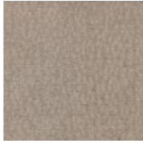
Outside Arm 3127-71CC