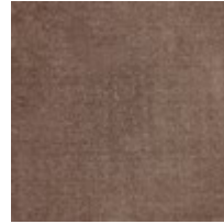
2-18" x 18" Pillows 2780- 31CC