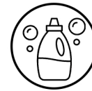
CLEAN SINK WITH MILD ABRASIVE