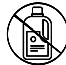
BLEACH STAYS ON TOO LONG