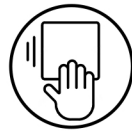
RUB LIGHTLY WITH SOFT CLOTH