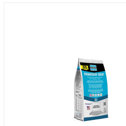
Laticrete Permacolor Bright... $32.00