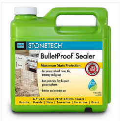
Laticrete Seal & Protect Natural... $189.99