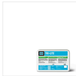
Laticrete Tri-lite White Thinset- 30... $44.45