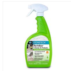
Laticrete Clean & Protect Citrus... $19.99