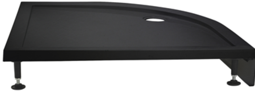
900 x 900 QUADRANT TRAY PANEL

DESCRIPTION: Leg Set & Plinth Kit (900X900 Panel)