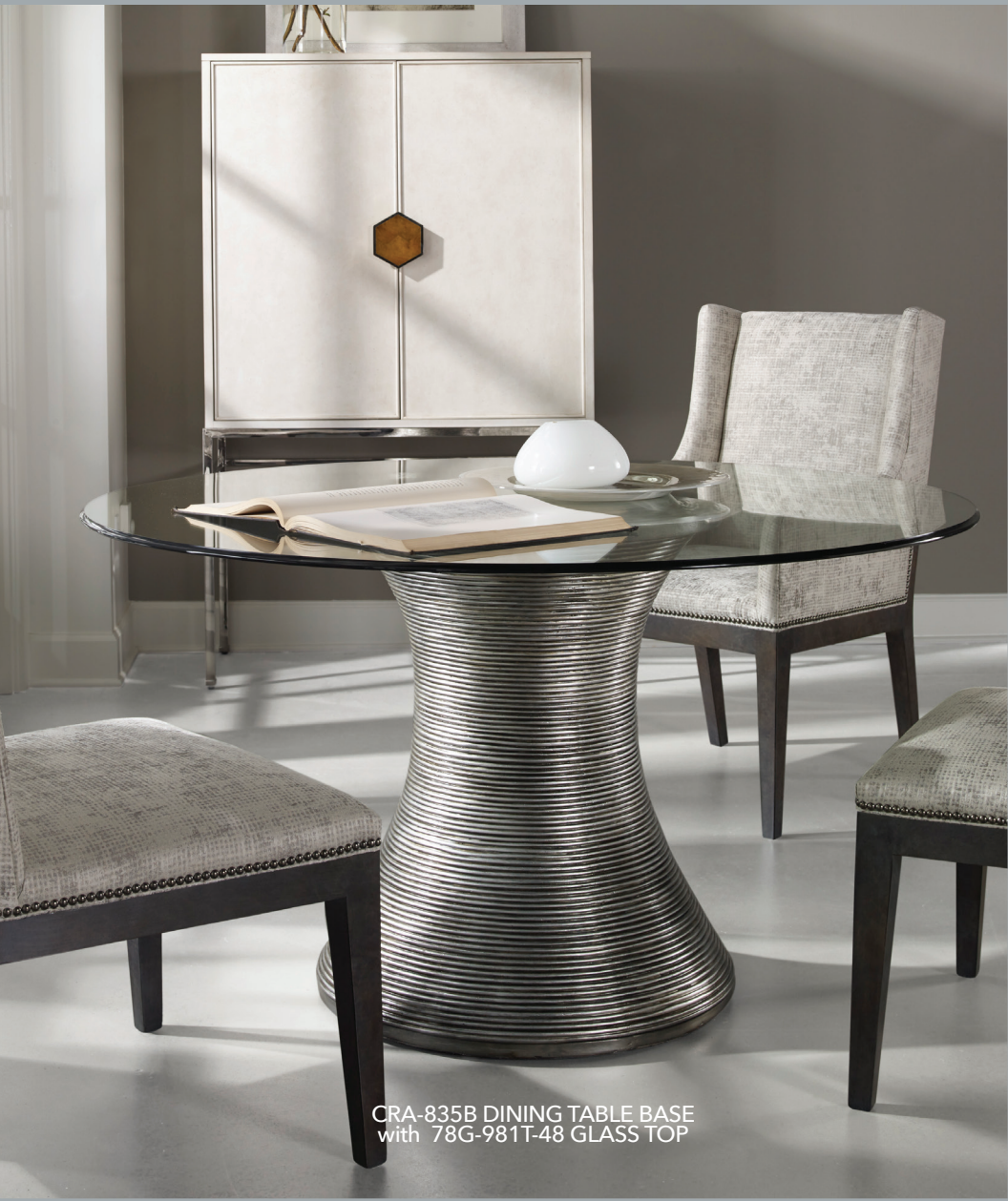
CRA-835B DINING TABLE BASE with 78G-981T-48 GLASS TOP