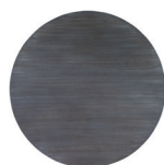
Table Top height is added to Table Base height for overall height measurement.

1/2" Tempered with Flat Edge CRG-901T-48 (48" Dia.) CRG-901T-54 (54" Dia.) CRG-901T-60 (60" Dia.)