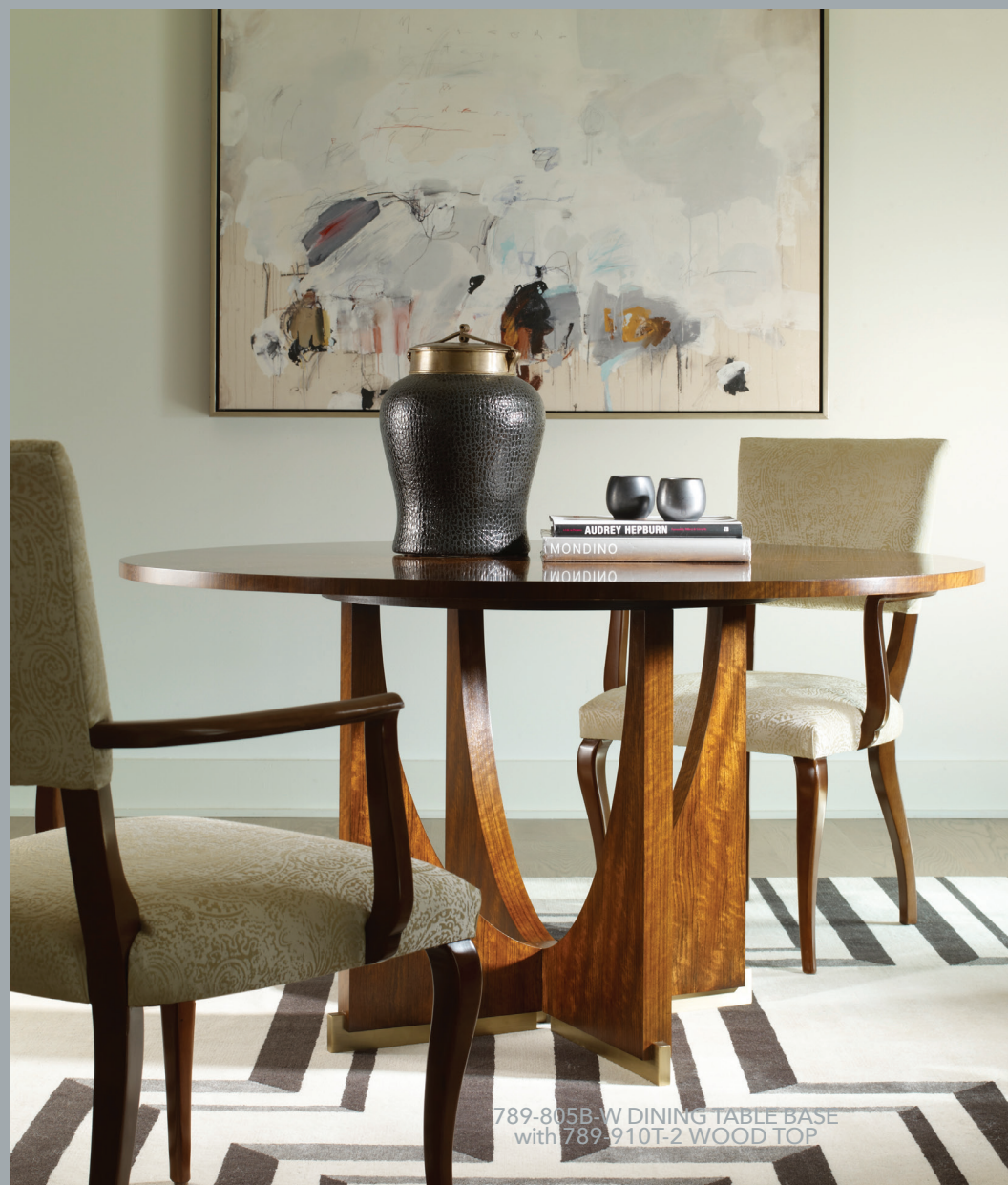
789-805B-W DINING TABLE BASE with 789-910T-2 WOOD TOP