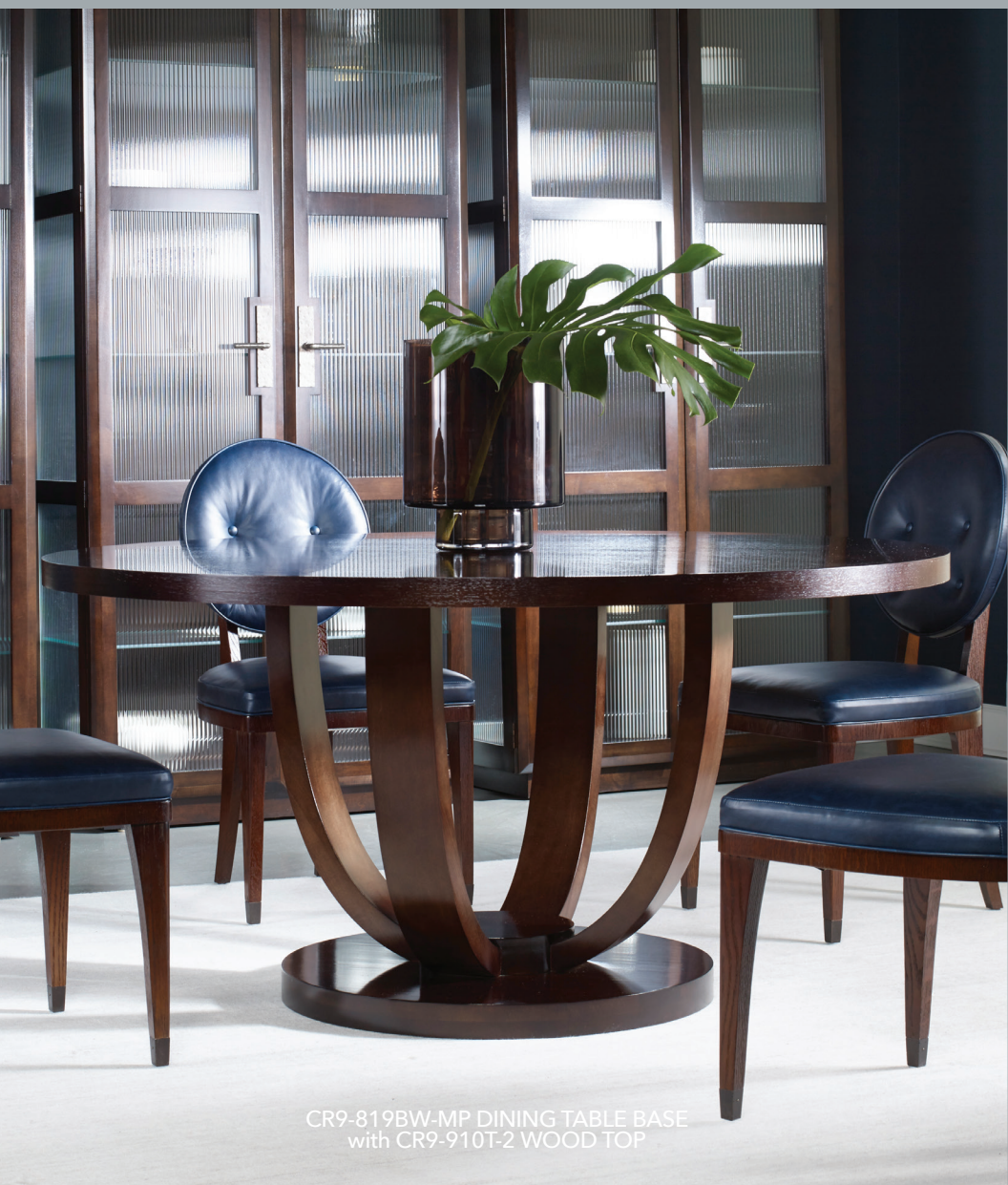
CR9-819BW-MP DINING TABLE BASE with CR9-910T-2 WOOD TOP