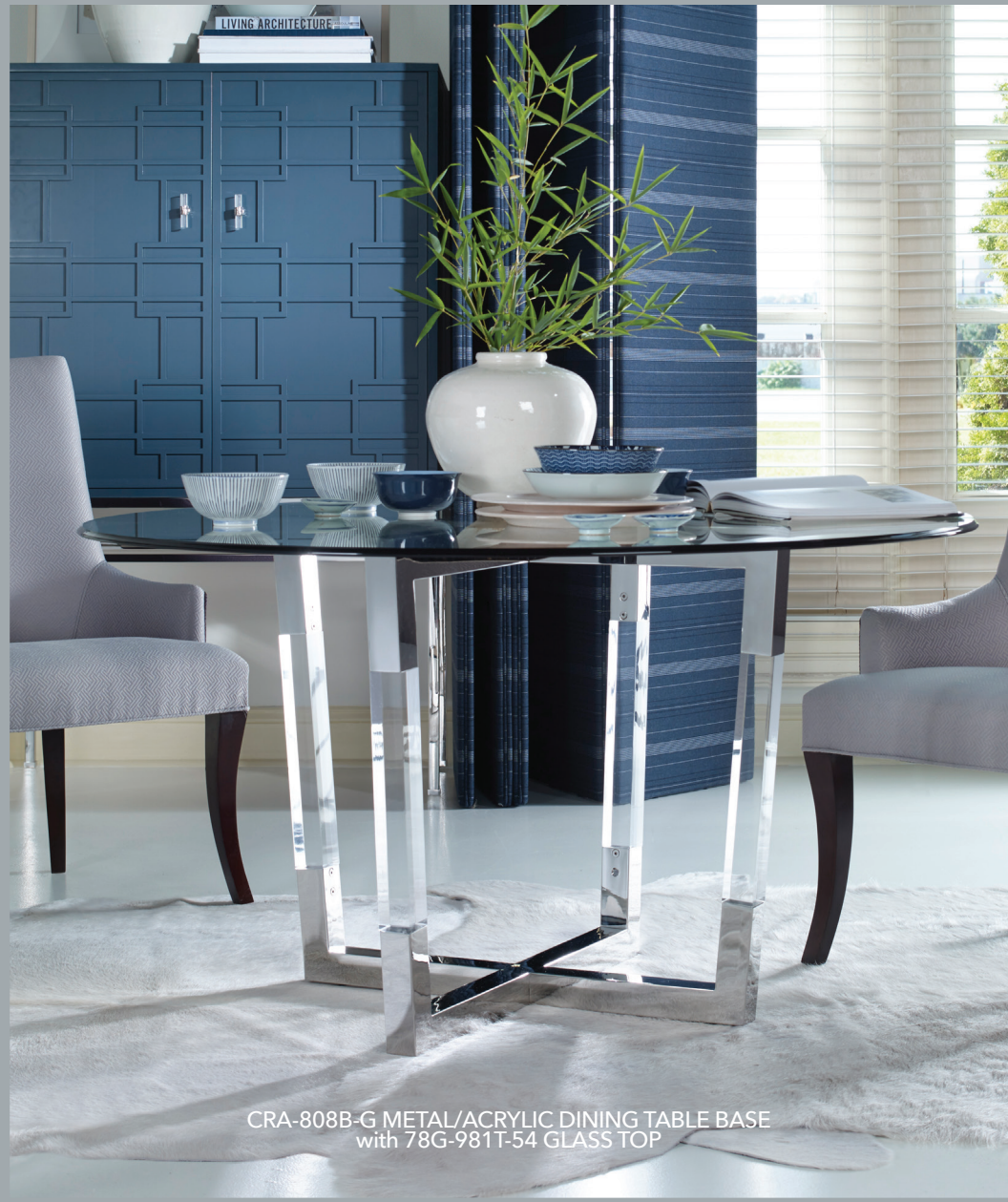
CRA-808B-G METAL/ACRYLIC DINING TABLE BASE with 78G-981T-54 GLASS TOP