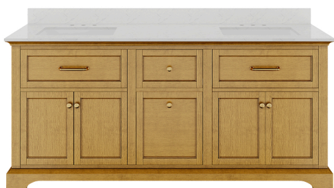
● Bathroom Vanity(With Backsplash)