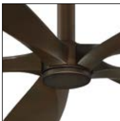
Light Cap included