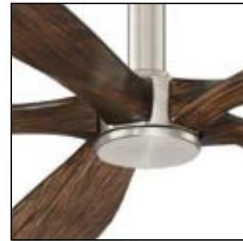
Light Cap included