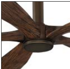
Light Cap included