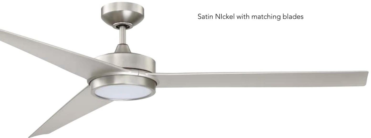
Satin Nickel with matching blades