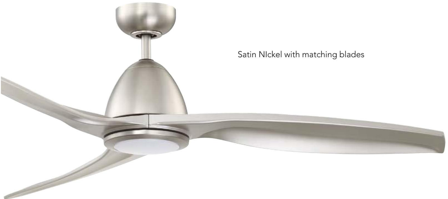
Satin Nickel with matching blades