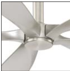
Light Cap included