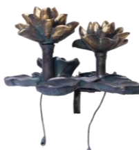
Lotus Topper 1 x