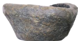
Fountain Basin 1x